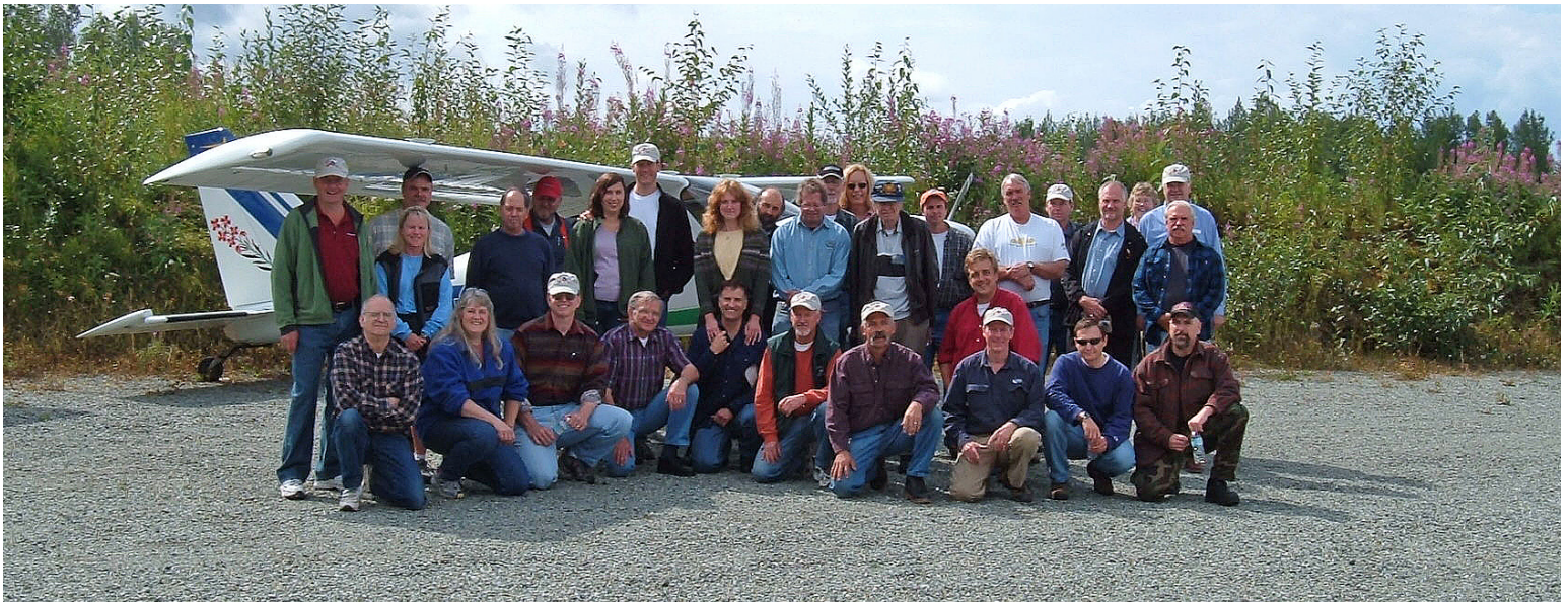
EAA Chapter 42 summer picnic attendees at Birchwood Airport.